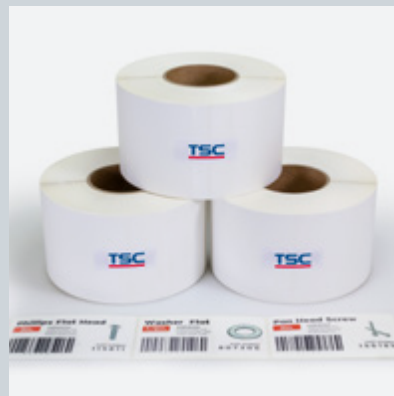
Inkjet Labels and Tanks