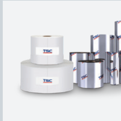
Thermal Printing Solutions