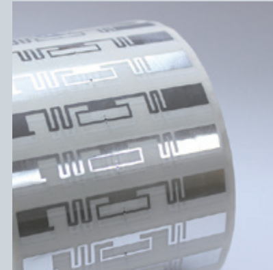
UHF RFID Labels